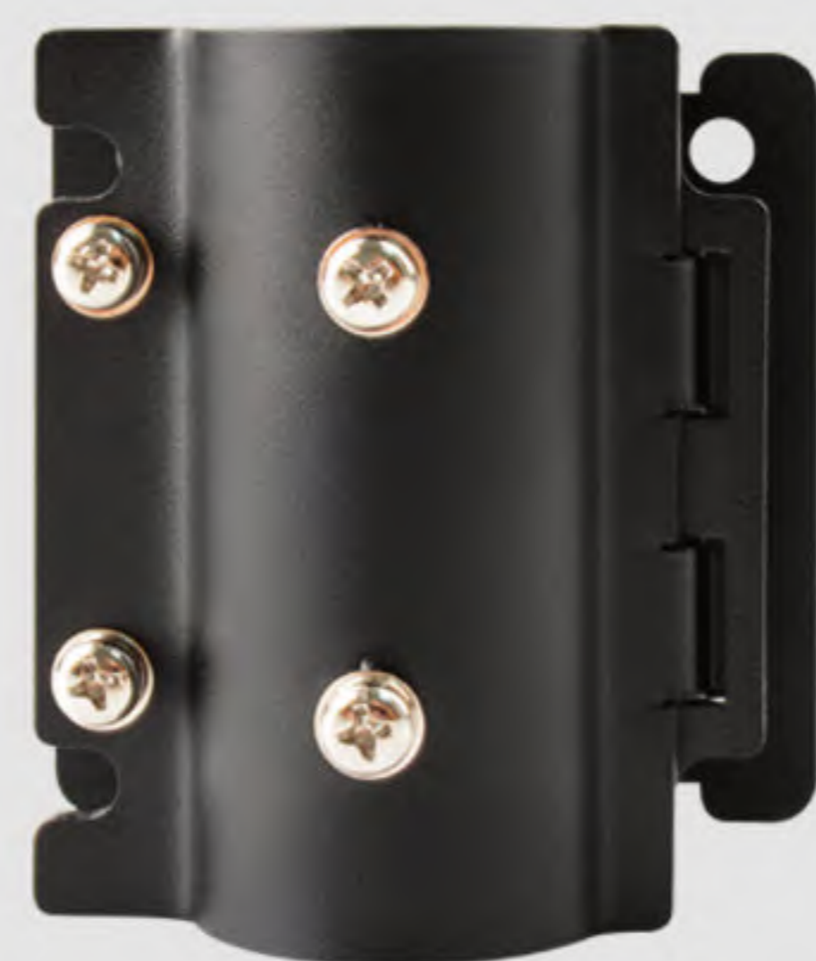
Industry Standard Support