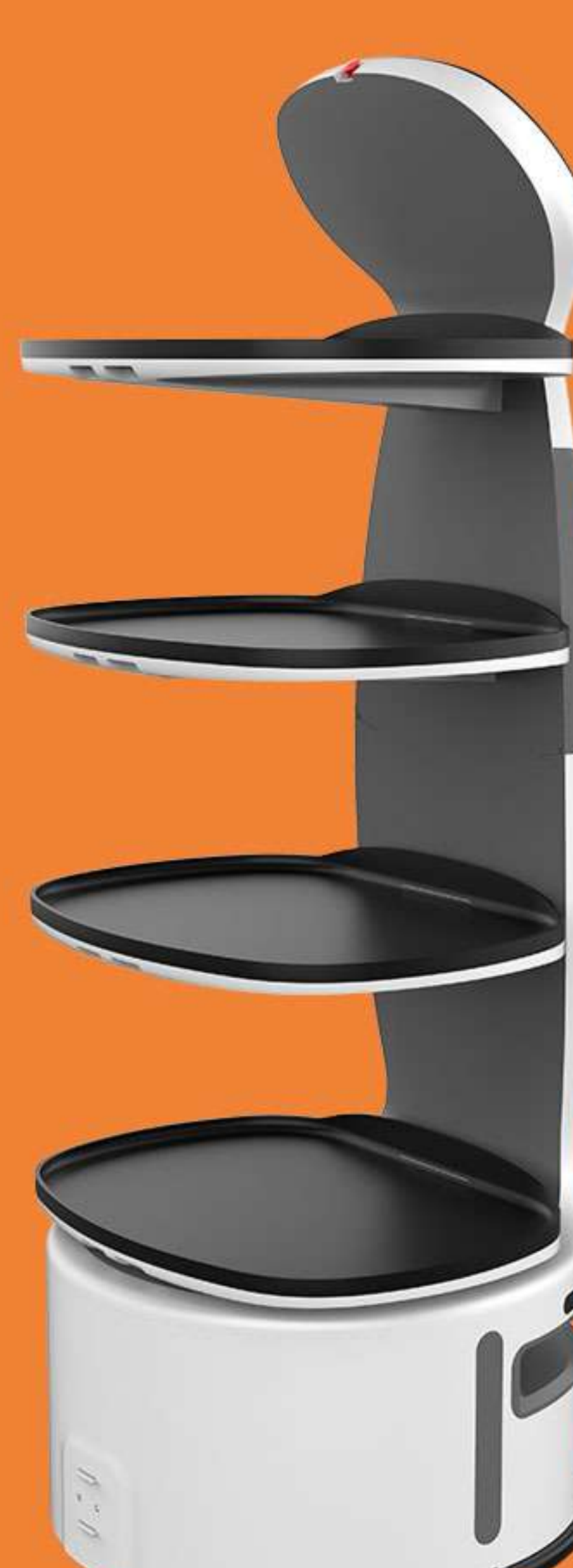
4-layer open tray