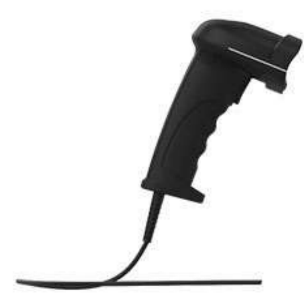
Barcode Scanning Gun